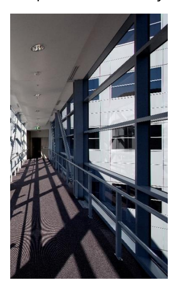
Figure 8.2: Fixed windows in corridor

Awning windows are also known as 'hopper' windows. These refer to windows hinged from the top. Awning windows should not be used in multi-storey buildings because they can act as smoke/ heat scoops from fires in storeys below.