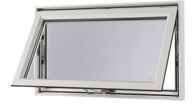
Figure 8.3: Awning window